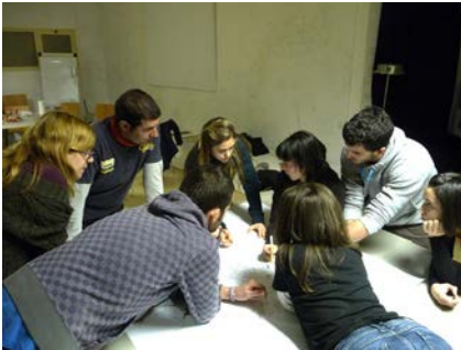
Figure 2: Talk sessions help us to reflect on and co-create upon previous walks

intentionally want to highlight as “spending time together by joining a dérive walk”. What happens when we set ourselves into a dérive walk with a group of people? What does emerge? What does this performative action originate? All of these are questions that invite us to transcend the idea of the objective, so that we focus on listening and creating as any good theatre improvisation exercise demands.