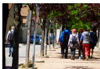
Figure 1: Walking and spending time together

The mixture of my role as artist, university teacher and doctoral student, brought me in 2016 to be part of the founding of international arts based research net Beyond Text. Joining peers with a long record as researchers, and discussing my practice and research with them, allowed me to start thinking of dérive as that arts-based research method, that I had until then been applying in diverse settings, and that I am willing to keep sharing and discussing at this PIN-C edition.